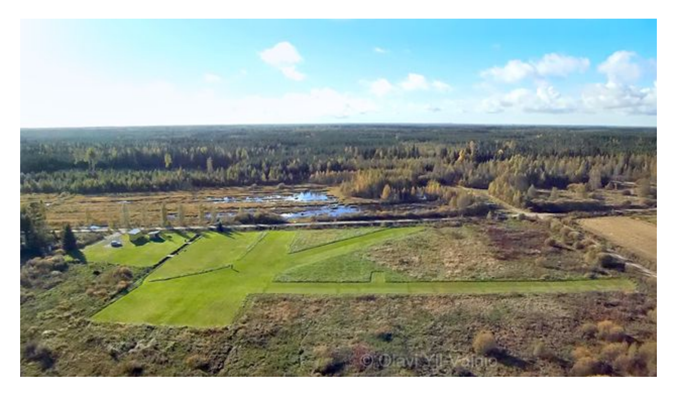
Photo of the airfield taken from the east side. The terrain around the field quite flat with is swamp and forest. More photos of the field and previous events can be found from the club website at <a href="https://seinajoenlennokkikerho.yhdistysavain.fi">https://seinajoenlennokkikerho.yhdistysavain.fi</a>